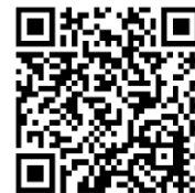
Video of using Inventech Connect

* Note Operation of the electronic conferencing system and Inventech Connect systems. Check internet of shareholder or proxy include equipment and/or program that can use for best performance. Please use equipment and/or program as the follows to use systems.