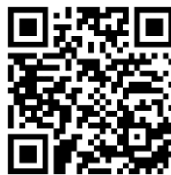
User Manual e-Voting